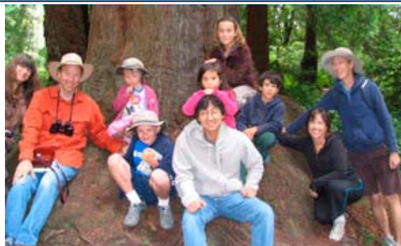
Birding for Everyone Family Walk Jun 2007

Total number of fledglings at Stow Lake Colony since 1993 -- 110!