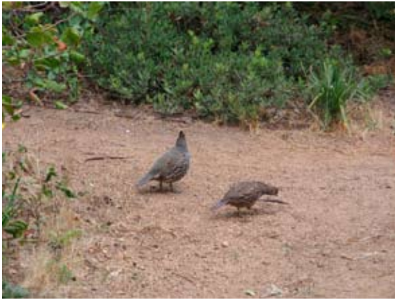
Eureka! Pair of adult quail with covey in the bushes