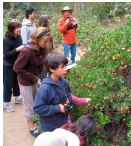
Looking for California Quail...

Photos at right taken by Nancy DeStefanis during the June 2007 family walk.