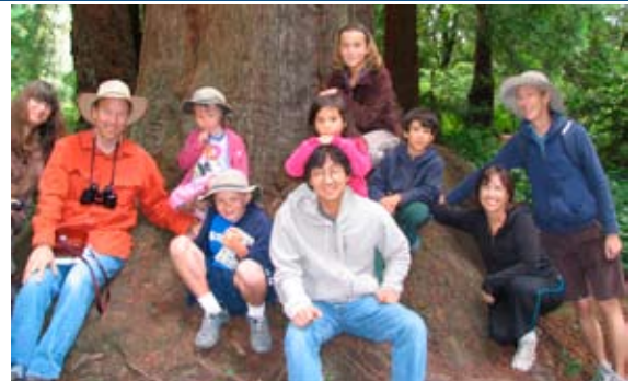
Birding for Everyone Family Walk Jun 2007