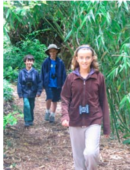
Hike through bamboo forest was great!