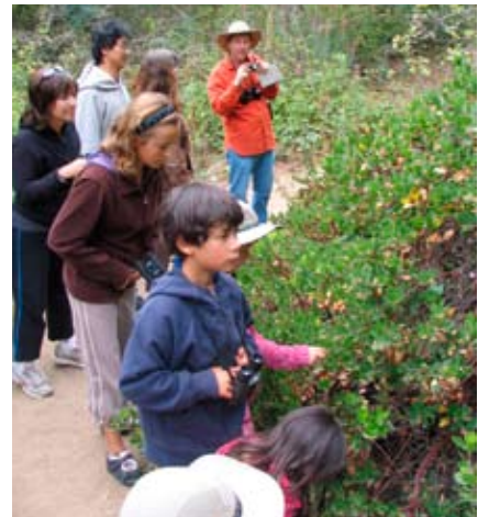
Looking for California Quail...