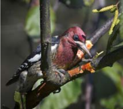
Red-breasted Sapsucker