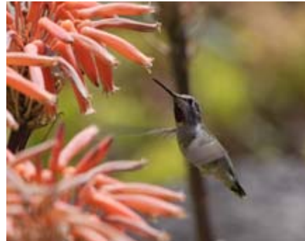
Anna's Hummingbirds

Come with our naturalists to look for these and other varied and vibrant birds!