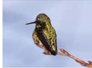
Allen's Hummingbird