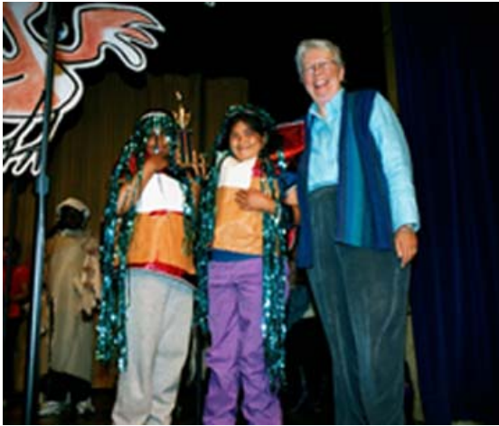
Allen's Hummingbirds from Sunnyside Elementary

From the archives, the 2002 bird calling contest winners.