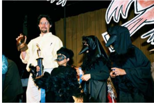
Common Ravens from Lakeshore Elementary