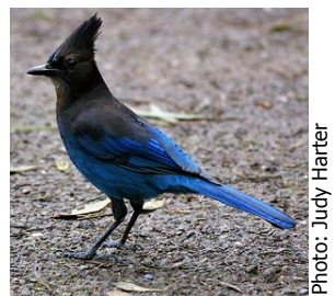
A steller's jay.

attracted a large number of western tanagers. We were able to observe these birds closely at our leisure as they gorged on the berries.