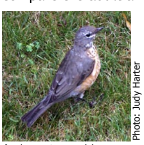
An immature robin.

The weather was hot and sunny for the September Birding for Everyone walk. About 25 of us set out with high hopes of spotting some early fall migrants. On our way to the California Garden we saw a flurry of movement in a winter's bark tree. On closer inspection we could see a profusion of ripe berries which were attracting a large number of birds, mostly speckled immature robins. It provided us with a great opportunity to compare the adult and younger birds. In