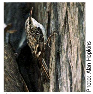
A brown creeper.

On our way back to the front gate, we were delighted to encounter a female California quail as she strolled along