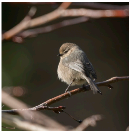
Top row: from left: Golden-crowned Sparrow, Yellow-rumped Warbler, Lesser Goldfinch. Bottom row: Pied-billed Grebe, Bushtit.