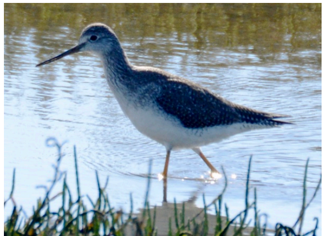
Clockwise from top left: Spotted Sandpiper, Least Sandpiper; Greater Yellowlegs, Horned Grebe.