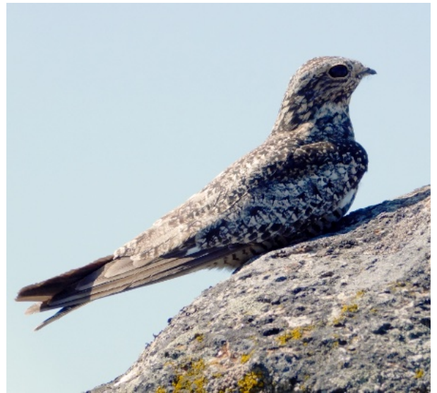
Common Nighthawk, Tuolumne Meadows.