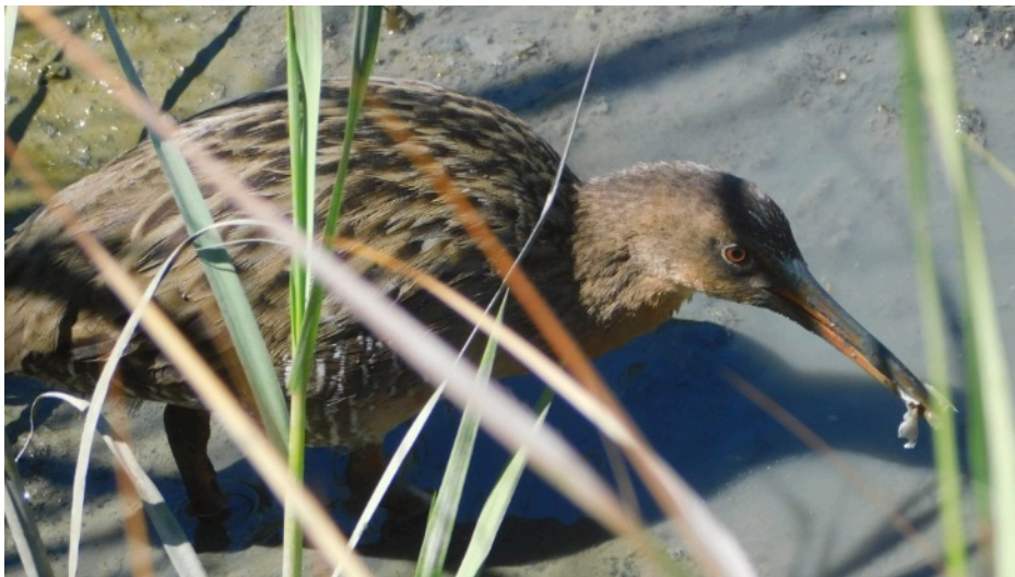
Ridgway's Rail, MLK Regional Shoreline, Alameda County.