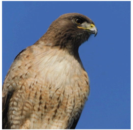
Red-tailed Hawk, Ortega St. near Sunset Blvd., SF.