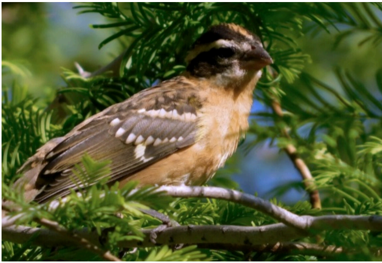
Black-headed Grosbeak, Camp Mather, Tuolumne County.