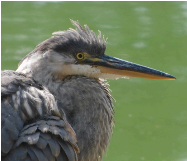
Great Blue Heron, Elk Glen Lake, Golden Gate Park, SF.