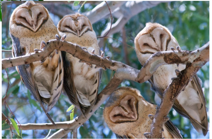
Barn Owls in San Rafael