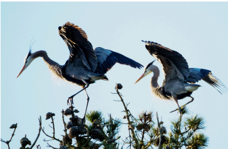
From top: nesting heron delivers a stick to its mate; a pair of herons bond during the mating season.

San Francisco Nature Education is in its 19th year of delivering comprehensive environmental education programs to students from schools in the San Francisco Unified School District.