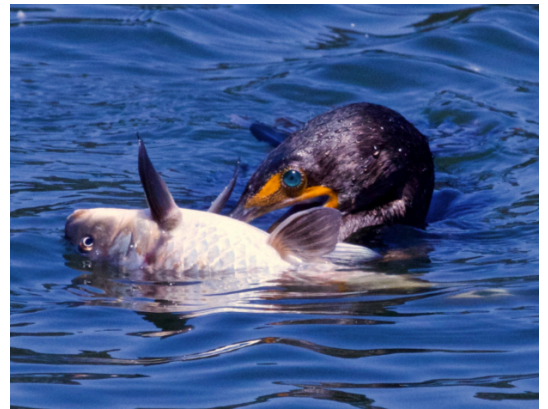
Young Great Horned Owlets in June; Clark's Grebe with chick at Lake Merced; Marsh Wren; grebe chick swimming alone; Double-crested Cormorant with a fish at Stow Lake .