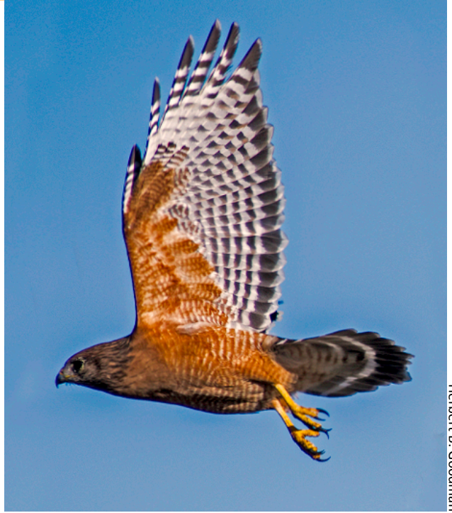
Herbert B. Goodman

Clockwise from top left: Snowy Egret; Red-shouldered Hawk; Northern Flicker; Hooded Merganser.