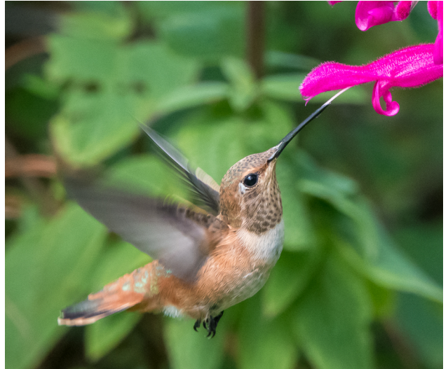
Allen's Hummingbird and Salvia