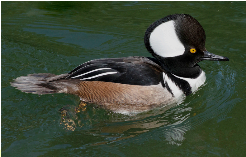
Herbert B. Goodman

Clockwise from top left: Snowy Egret; Red-shouldered Hawk; Northern Flicker; Hooded Merganser.