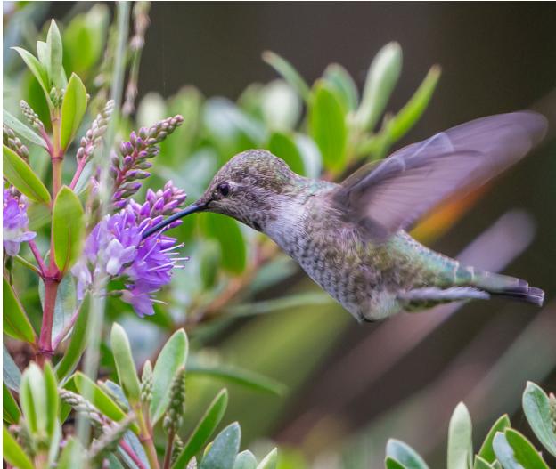
Anna's Hummingbird and Hebe