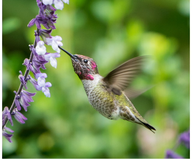
Anna's Hummingbird and Salvia