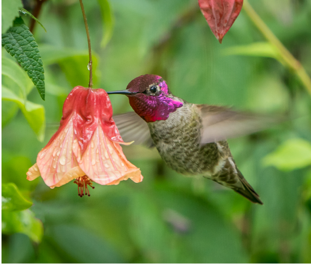
Anna's Hummingbird and Abutilon