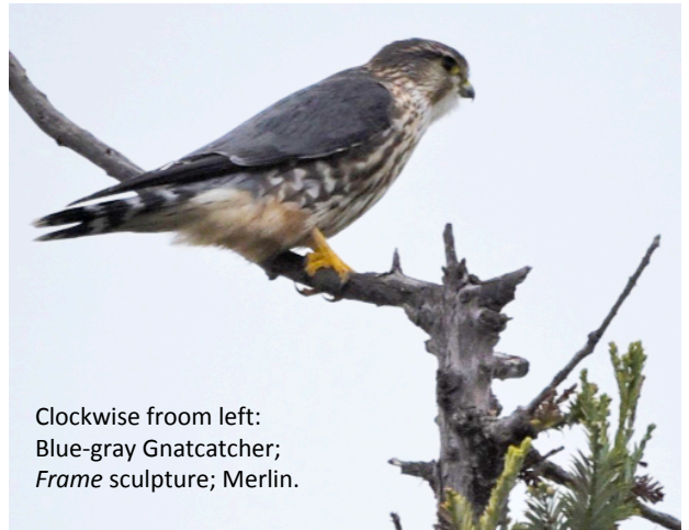
Clockwise from left: Blue-gray Gnatcatcher; Frame sculpture; Merlin.

The park is located on the hill to the right, but before heading up the hill check the treetops for American Kestrels and Merlins . The trailhead is marked by Refrain , a site-specific sculpture by Walter Hood.