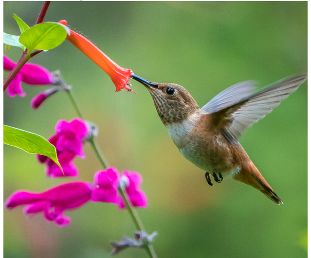
Allen's Hummingbird and Penstemon & Salvia