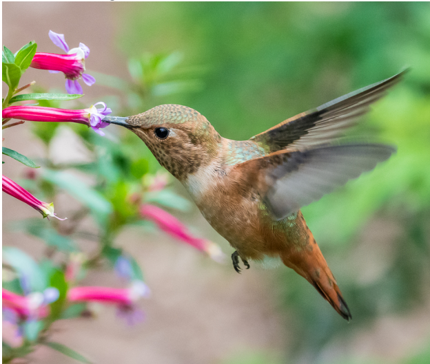
Allen's Hummingbird and Cuphea "Cigar plant"