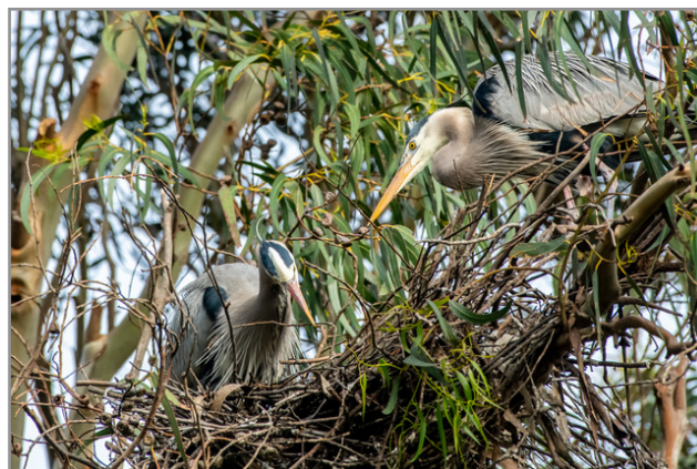
Pair of Great Blue Herons on Yacht Road in the Marina