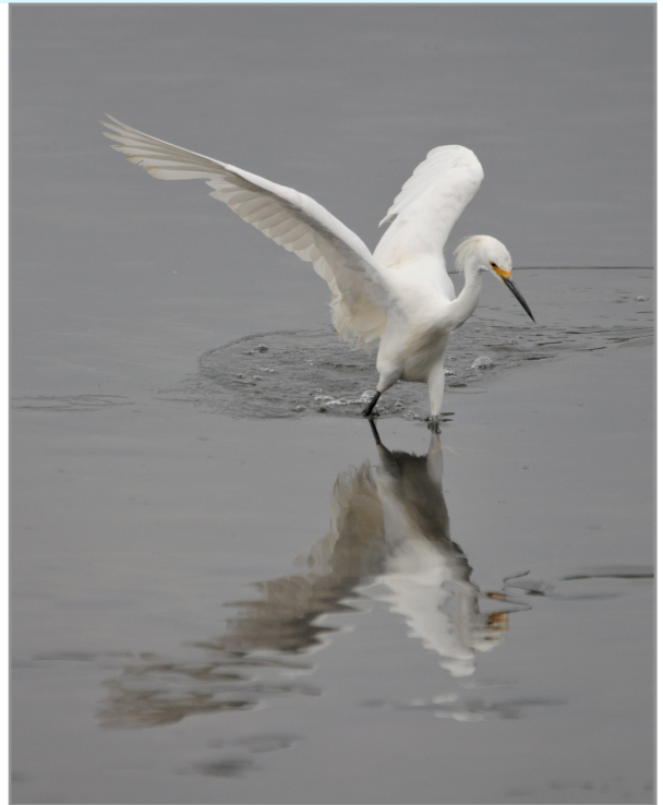
Snowy Egret (Crissy Field)