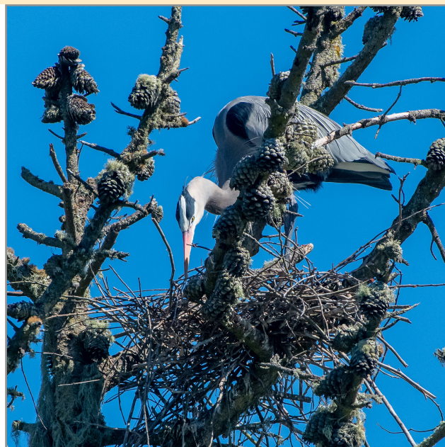
Great Blue Heron at nest by Waterfall on March 14, 2023