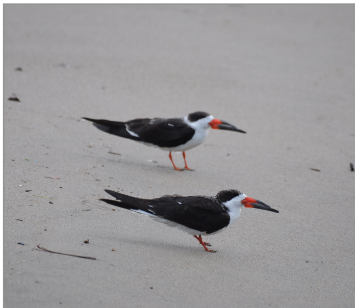
Black Skimmers (from the Marina)