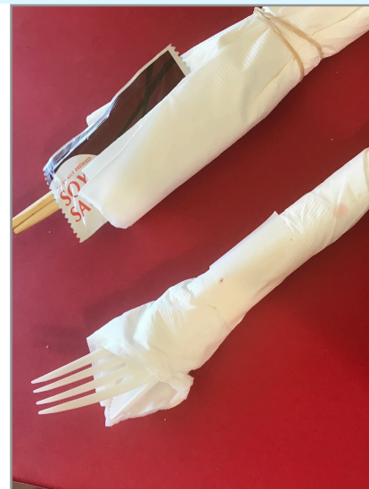
Typical items included in takeout orders in San Francisco

Contact the DOE: SF's Department of the Environment (SF Environment) works with restaurants through outreach and education so they can comply with the law. SF Environment does not fine for violations — they work with the restaurants. However, these single-use items continue to be included with takeout orders. Please insist on no single-use items when you order. Food delivery services must give you the option online to ask for utensils. If you do not opt for the utensils, they are forbidden from including with your food order. SF Environment is the agency responsible for compliance and outreach/education. One can provide information about a non-compliance with SF zero waste policies through the web at https://tinyurl.com/569sv5kz . No worries — cafes and restaurants will not be fined.