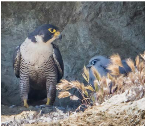
Parent and chick