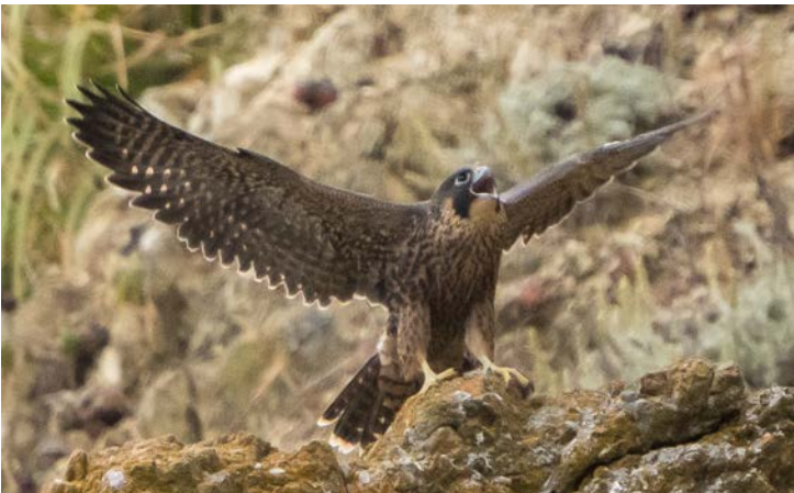
Chick calling out for food