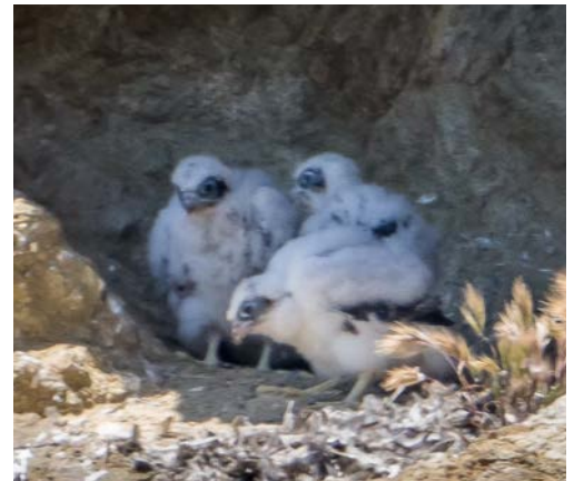
Three new chicks