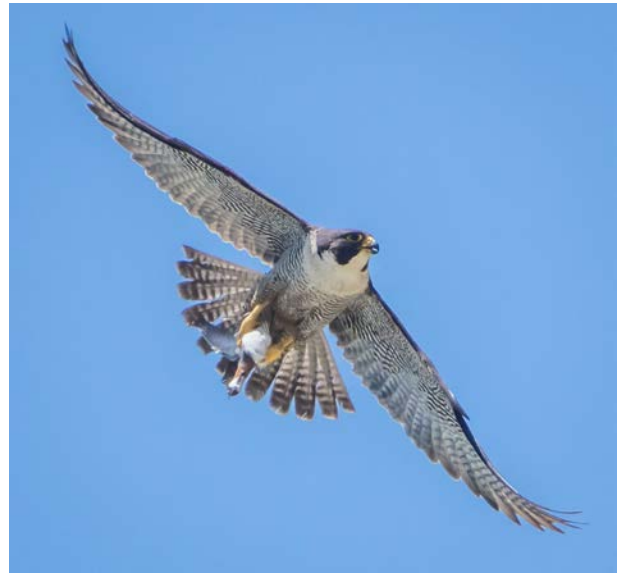
Catch of the day – Common Murre in talons!