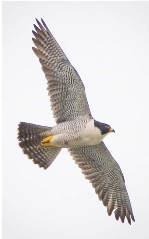
Adult falcon flies high above Devil's Slide