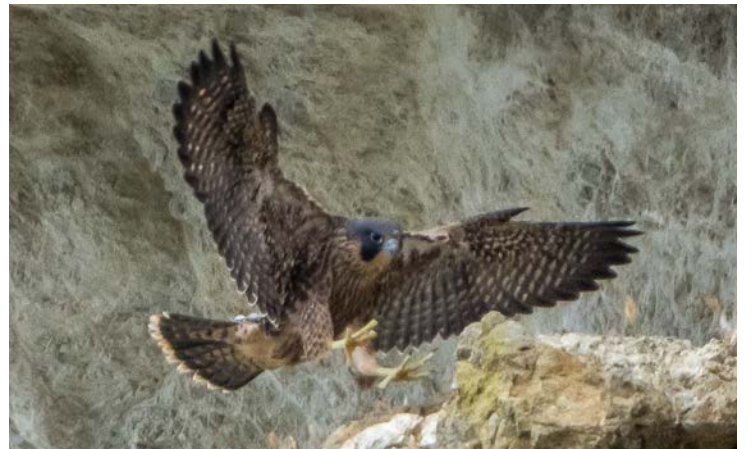
Boots off the ground!