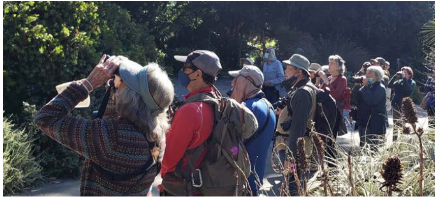
Our group looking at Black-throated Blue Warbler.

After a long COVID break it was wonderful to see a gathering of new and familiar faces on a beautiful October morning at the Botanical Garden Gate. At one time a flock of Canada Geese would have been a sign of the season's change however the flock of thirty or so honkers that greeted us are now year-round city residents.