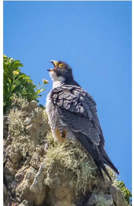
Adult calling its mate