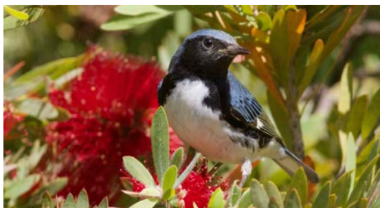
Black-Throated Blue Warbler (SFBG)