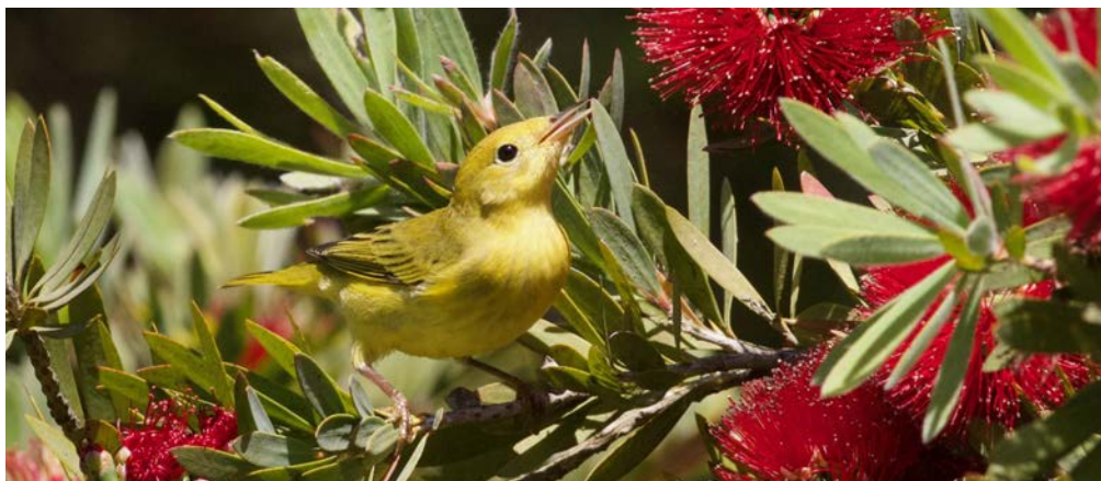
Yellow Warbler (San Francisco Botanical Garden field trip)