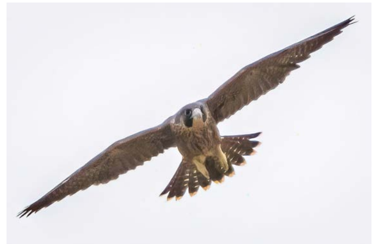
Fledgling heading for the sky