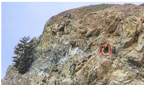
Devil's Slide Cliff (cave marked in red) by Ian Reid