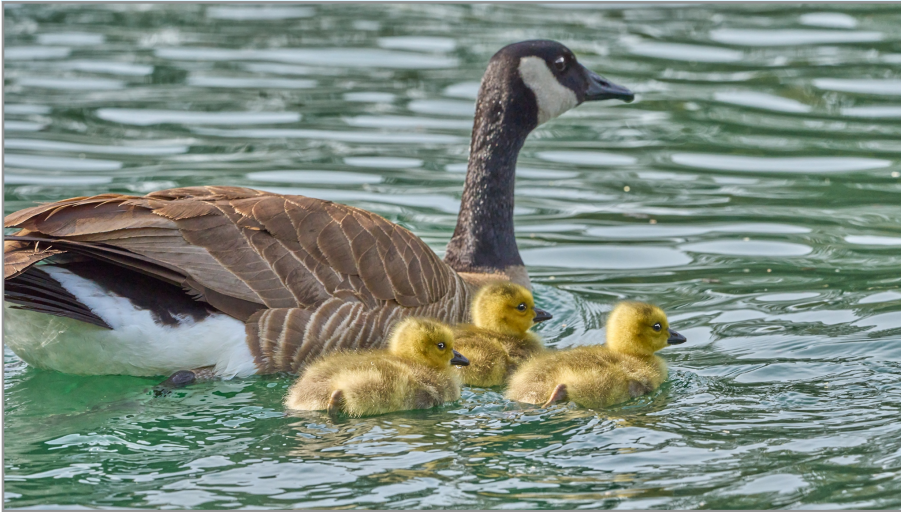
Canada Goose with goslings