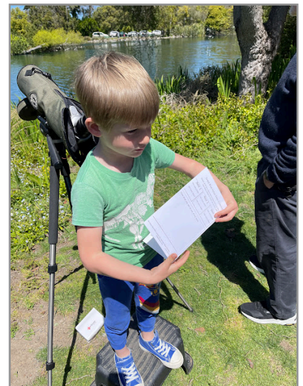
Youngster with his new SF Nature Ed field journal