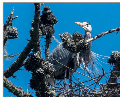
Heron in waterfall nest