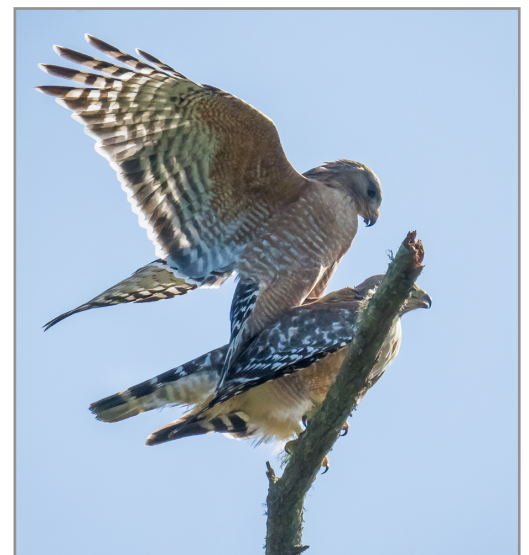
Red-shouldered Hawks mating