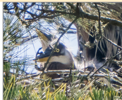
New chicks at Island by the Boathouse

Email: info@sfnature.org tel.: 415-205-0776