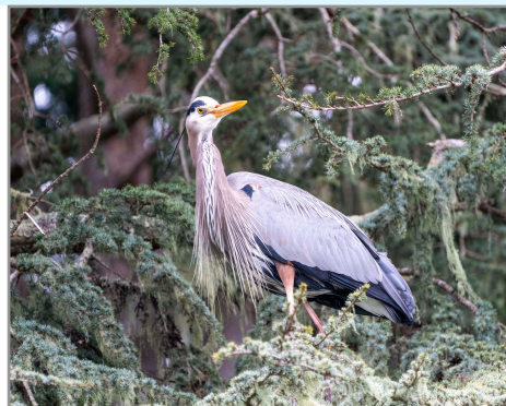
Heron resting on Strawberry Island