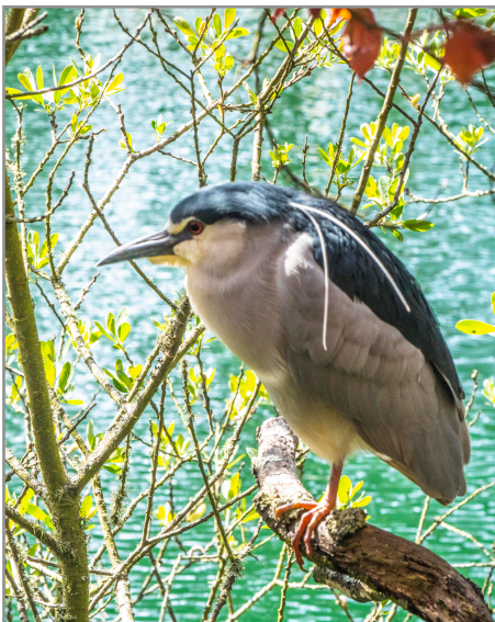
Black-crowned Night Heron