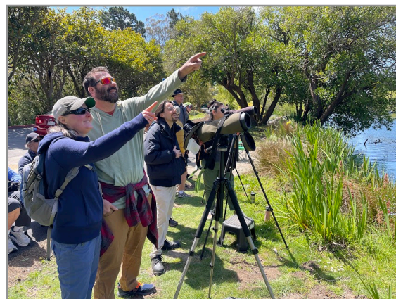
Volunteers show the Herons to the public on Opening Day